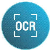
Optical Character Recognition

Higher Duty Cycles and Periodic Maintenance Intervals provide greater volume with fewer routine service calls so you can stay focused on productivity.